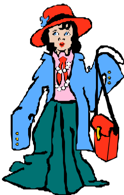
"Children learn through role play"

The song goes as follows to the tune of "Oh My Darling